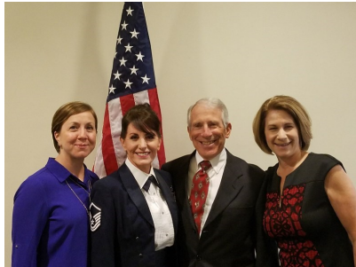
State Conference photos: EANGA board at our booth (left); EANGA officers at the banquet (above), and Professional Development session (below).